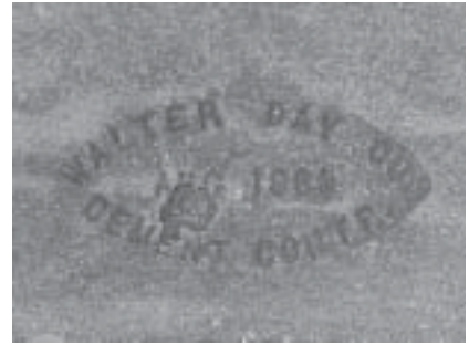
Walter Day Co. 1960