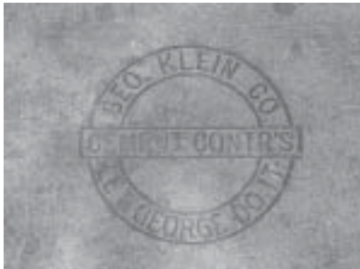
Geo. Klein Co.