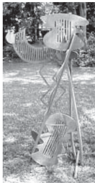
Stainless Steel Sculpture by Mac Whitney, on Goodwin.