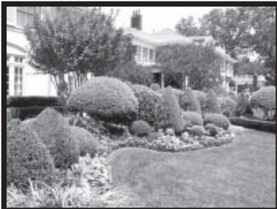
Totally organic garden on Swiss Avenue

“Roses”, he said, “are difficult to grow in Texas. Feed them in the