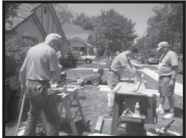
Amigos at work on Richard Avenue.

Amigos Days, sponsored by the North Texas Conference of the United Methodist Church and People Helping People, is a hands-on ministry uniting urban and suburban churches. Residents in urban neighborhoods join forces to help with revitalization in the community.