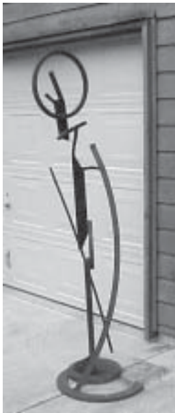
Welded Steel Abstract Figure in the 5100 Block of Vickery.