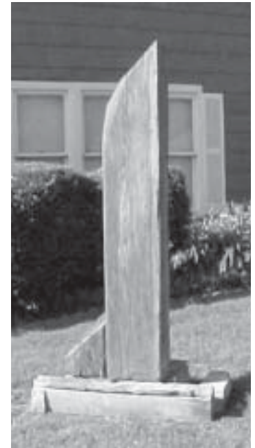
Wood Minimalism on Goodwin at McMillan.

Vickery Place is home to an eclectic group of people, and the yard art in the neighborhood reflects this diversity. Downtown Dallas will soon have the Nasher Sculpture Center, but VP has long had its own sidewalk sculpture exhibit. These photos show a sample of the original art scattered throughout the neighborhood.