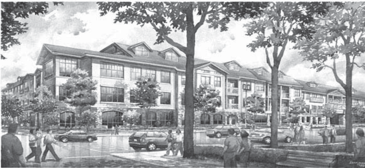
Artist's rendering of the Easton apartments, Henderson at Manett

The development is located across Manett St. from Bonham Elementary School. Phoenix has recognized that the planned entrance to the residents' parking garage, located on Manett approximately three hundred feet south of Henderson, could create a traffic logjam at the peak hours. Manett is currently a one-way street during the hours when school children are arriving and leaving. With parents' cars parked along both sides of Manett, there is only enough space for traffic to flow in one direction. Phoenix has proposed to create parallel parking spaces on the east side of Manett that are recessed into the curb line, similar to the parking on Willis at Eastbridge. This would allow enough space for two way traffic on Manett. Phoenix will create a sidewalk easement on the apartment property in order to create enough space for the added parking.